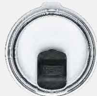
Magnet Slider Lid

YETI®'s laser marking process is guaranteed through the life of the product no scratching or fading. Add a custom design to any member of our stainless steel drinking vessels to make your YETI® customized.